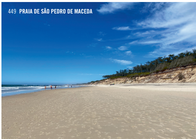
449 PRAIA DE SÃO PEDRO DE MACEDA

Porto's most popular urban beach is a great choice for those seeking beginner surf lessons, although experienced local surfers enjoy it too. There are a few reputable surf schools here, as well as the beachfront 'transparent building' (as the locals call it) with beach bars and restaurants with outdoor terraces.