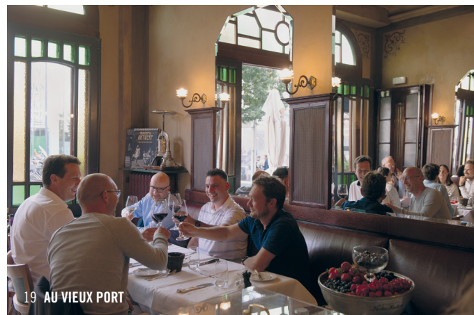
19 AU VIEUX PORT

It's named after a town in the Congo, but this lively Antwerp brasserie couldn't be more Belgian. The interior is decorated with wood panelling, mirrors and nostalgic colonial memorabilia. The menu lists classic dishes like shrimp croquettes, Zeeland mussels and pork cooked in mustard sauce. Also open for breakfast.